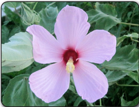
swamp rosemallow ( Hibiscus grandiflorus )

Nature Coast Chapter will host its Fall Florida Native Plant Sale on Saturday, October 18 from 10a.m. to 2p.m. at Harvester United Methodist Church in Pasco County. For more information, visit www.PascoNativePlants.org .