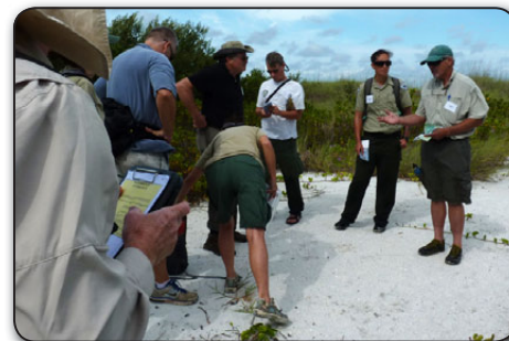
LMR at Shell Key Preserve in Pinellas County, June 2014