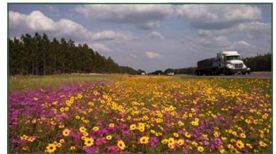
FDOT interstate median planting of goldenmane tickseed ( Coreopsis basalis) and annual garden phlox ( Phlox drummondii) (native to Texas). Although the plantings are not entirely native, native wildflowers such as Southern fleabane ( Erigeron quercifolius) and Carolina woollywhite ( Hymenopappus scabiosaesus) also find friendship there.