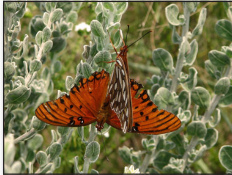
"new life" on Florida goldenaster

The birds and wildflowers cooperated to the delight of both birders and botanizers. PEAR Park participants were wowed by the native plant gardens throughout, especially the Meadow Trail, where Peg Urban caught a great shot of "new life." Those who went to the Hilochee WMA to see the pitcher plants were also rewarded with a few pine lilies in bloom, a budding giant orchid (the state threatened Pteroglossaspis ecristata ) as well as many of the more common fall bloomers. All in all, everyone seemed very happy with the mixture of birds, wildflowers, butterflies and beautiful scenery. We're all looking forward to next year's festival.