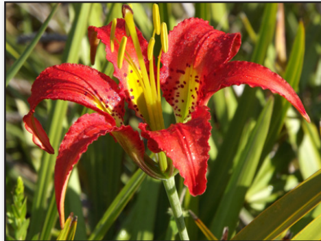
pine lily