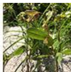
Rugel's Pawpaw ( Deeringothamnus rugelii )

The article above includes details about the Pawpaw Chapter's survey initiative and the photos (left and middle) are of the Rugel's Pawpaw.