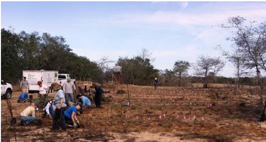
Restoration planting of sandhill rescues at SJRWMD.

We are looking for donations — new items, gently used items, hand crafted items, etc. — for the Silent Auction at the FNPS conference. If you have anything you would like to donate, please contact Jenny Welch at fnaturegirl@outlook.com or (407) 319-2488.