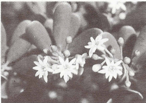
Joewood's fragrant blossoms.

From Native Trees and Shrubs of the Florida Keys , Scurlock. Used by permission.