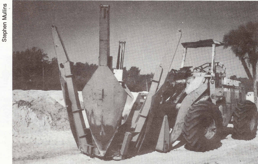
This tree spade with a 50" maw was used to move the joewood trees.

Once the woody plant was transplanted, with a good root ball preserved by the use of the tree spade, the primary problem was to provide sufficient water to prevent desiccation and to initiate growth of additional roots to replace those lost in the moving. Since the extremely shelly soil holds water so poorly, it was found that the addition of the gel, Terra-Sorb™, to the hole prior to placement of the new plant was necessary. In addition, transpiration was decreased by the use of an anti-desiccant spray, or by simple hand removal of most of the leaves.